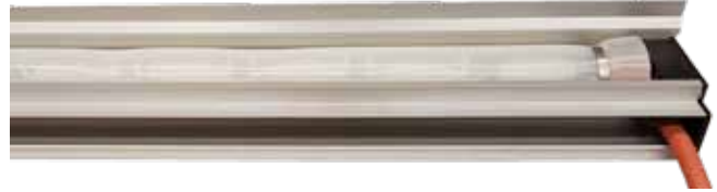
LU4TX66 + Tube Silicone / Xenon 3W/5W max.